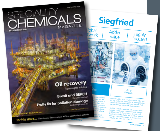
ABOVE: Front Cover / Inside Front Cover Combination Example